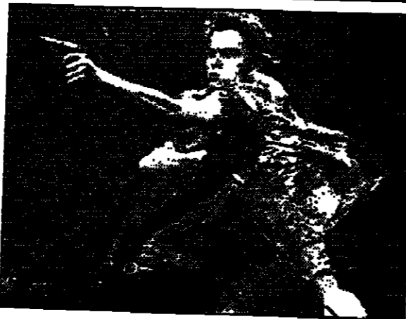
'William Shakespeare's Romeo & Juliet' provides a modern twist to the classic play.